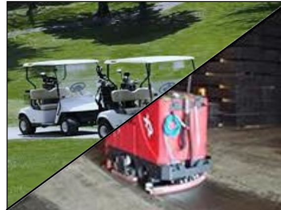
Floor Care & Leisure