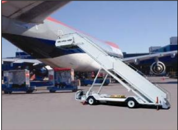
Airport Ground Support