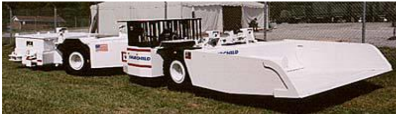
Mining Equipment (Fairchild Mine Scoop)