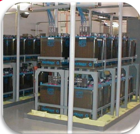
Telecom – Wireline