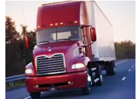
Heavy Duty/Commercial (Auxiliary Power and Starting)