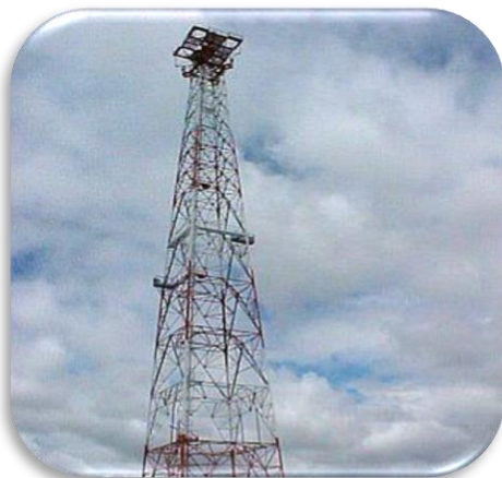
Telecom - Wireless