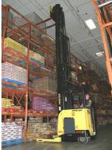
Narrow Aisle Reach Truck