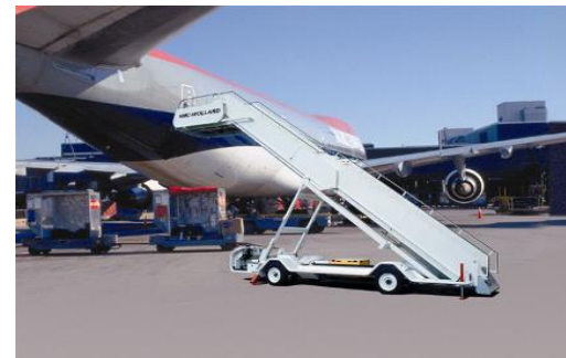
Airport Ground Support Equipment