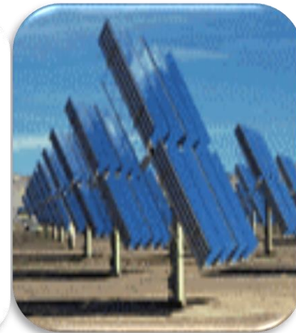
Renewables (Wind & Solar )